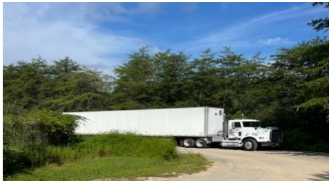
Semi load of livestock feed headed to Eastern Kentucky for Flood Relief

A few examples of this are illustrated through the funds raised by members and the local association to send fencing supplies to Western Kentucky after the tornado and livestock feed to those impacted by flooding in Eastern Kentucky. These supplies were gathered and delivered quick-