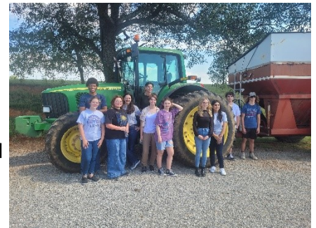
FSHS "Tomorrow's Leaders" visit Double V Farms.

Along with doing great works, Cattlemen's members are supporting the Kentucky Cattlemen's Association which serves a voice for Kentucky Cattle producers in front of congress, the state legislature and government agencies. Members receive exclusive information like the Cow Country News which is a monthly publication. They also support the Beef Council with Kentucky Checkoff dollars. The beef council is the leader in marketing and beef promotion in the state.