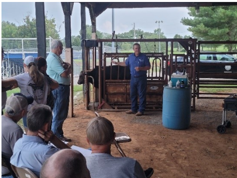
Cattlemen Association Meeting- BQCA Training. Members learn how to work, handle, and vaccinate cattle.

Members host educational groups like "Tomorrow's Leaders" to help Franklin-Simpson High School students learn more about agriculture and how it impacts their everyday lives from the clothes they wear to the food they eat. They also learned about how different sectors of agriculture affect our local economy.