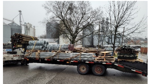
Fencing supplies donated to Western Kentucky Tornado Relief by Simpson Co. Cattlemen